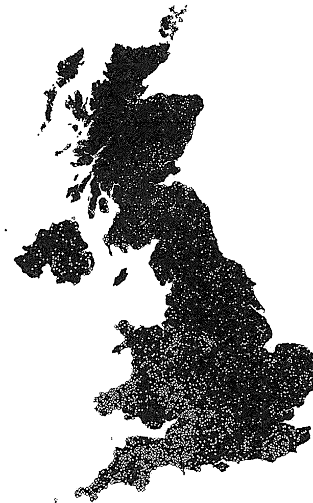
Figure 3: UK map of organic holdings 2004 (adapted from Defra (2006))

It is also suggested that the potential of organic production to feed urban areas needs to be explored. Test sites need to be established in and around European cities, to establish maximum sustainable yields using the Cuban model as a bench mark but also benefiting from existing project experience in Europe as documented by FAO.